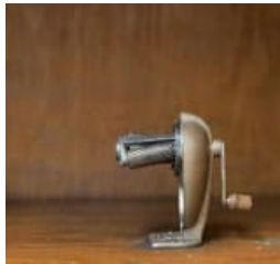
Only People with an IQ of 130 Can Name These Items