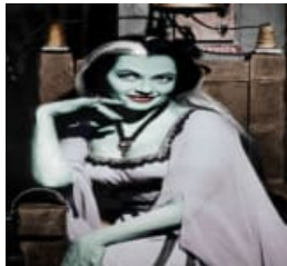
Quiz: Can You Pass This Ultimate Boomer Quiz