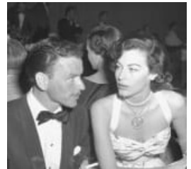
The Tragedies That Destroyed the Rat Pack